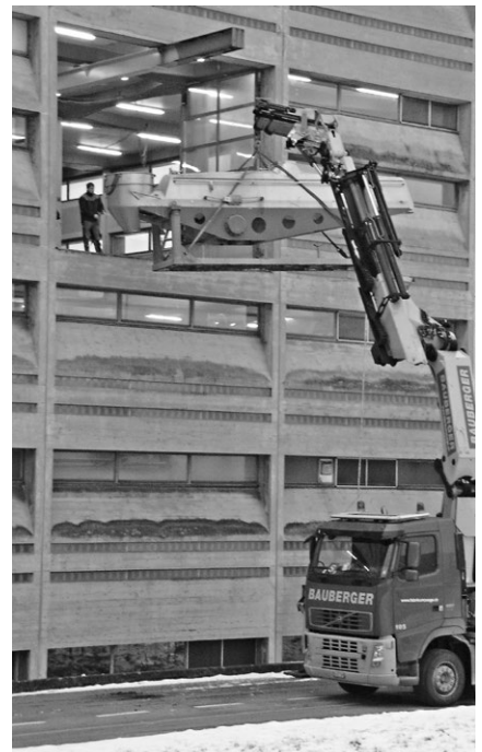
Deployed at Nutritec AG, Hochdorf

The 7/24 operation is the rule. Orders are also carried out abroad.